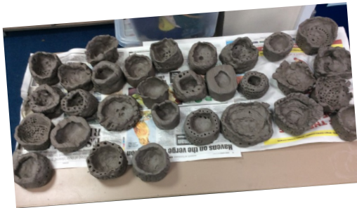
Year 1 have been making clay pots.

It was lovely to see so many parents at Assembly this morning. Supporting the children with their learning is very important and it gives them a boost when they can share their excellent work with everyone.